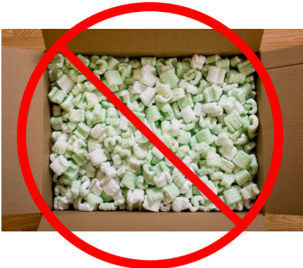
NO PACKING PEANUTS