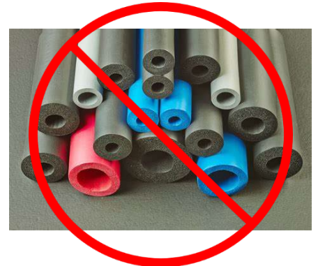
NO PIPE INSULATION