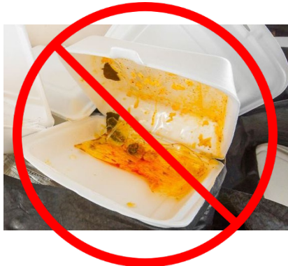
NO DIRTY FOAM PRODUCTS