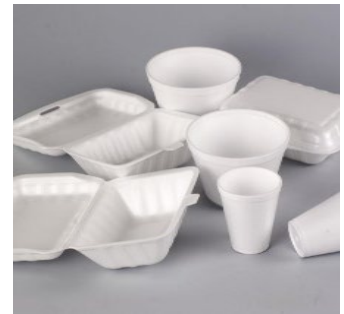
CLEAN #6 PLATES & CUPS